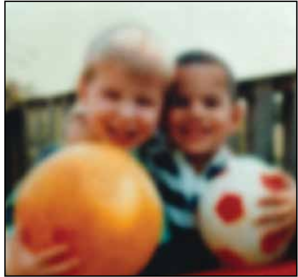
The same scene as viewed by a person with cataract